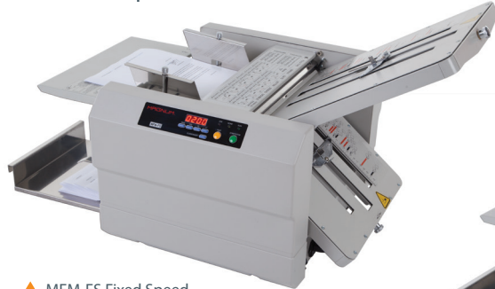
▲ MFM-FS Fixed Speed

The Magnum range of electric folding systems help to save time and effort.