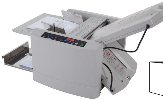
▲ MFM-PS Programmable