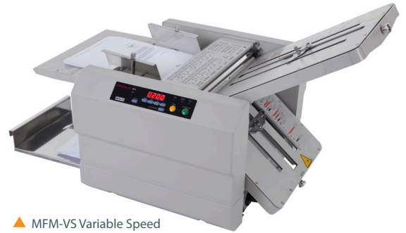
▲ MFM-VS Variable Speed